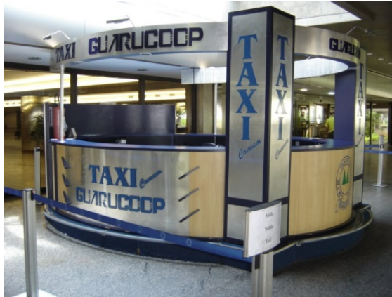
Figure 2 – Guarucoop desk