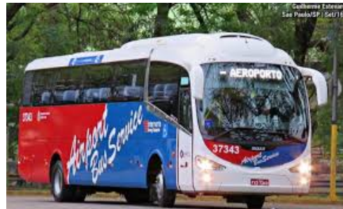
Figure 3: Airport Bus service desk (left). Typical airport bus (right).