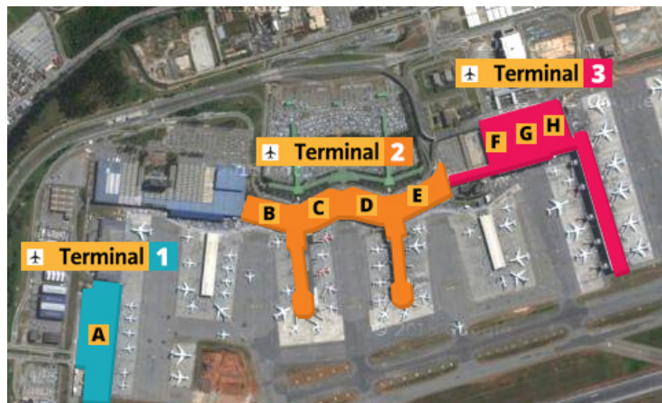
Figure 1 – GRU airport terminals

GRU is about 45 km distant from Escola Politécnica of USP and the recommended hotels as pointed in the symposium website.